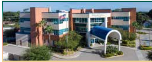
Watson Clinic Bella Vista Building 1755 N. Florida Ave. • Lakeland

To schedule an appointment with an OB-GYN physician, please call 863-680-7243 .