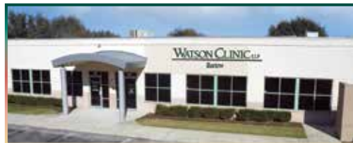
Watson Clinic Bartow Building B 2000 Osprey Blvd. • Suite 201 • Bartow

Education classes are provided exclusively for established Watson Clinic OB-GYN patients. To reserve your seat for one of these classes, go to WatsonClinic.com/Events or call 863-393-9475 for more information.