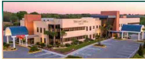
Watson Clinic Highlands 2300 E. County Road 540A • Lakeland