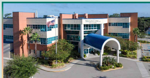
WATSON CLINIC BELLA VISTA BUILDING 1755 N. Florida Ave. Lakeland | 3 rd Floor

Housed in the Watson Clinic Bella Vista Building , our practice is designed with your convenience and efficiency of care in mind. We can assure that every necessary resource – including on-site laboratory, radiology and EKG services, and an in-house pharmacy – is well within reach, allowing for a greater continuity of care and eliminating the need for multiple visits. Additional services like valet parking and wheelchair assistance make patient visits even more comfortable and welcoming.